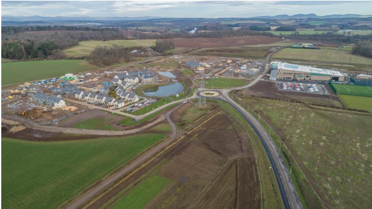
Figure 2: Aerial View of Bertha Park (Phase 1) Development, January 2019. The school and sports fields can be seen in the top right